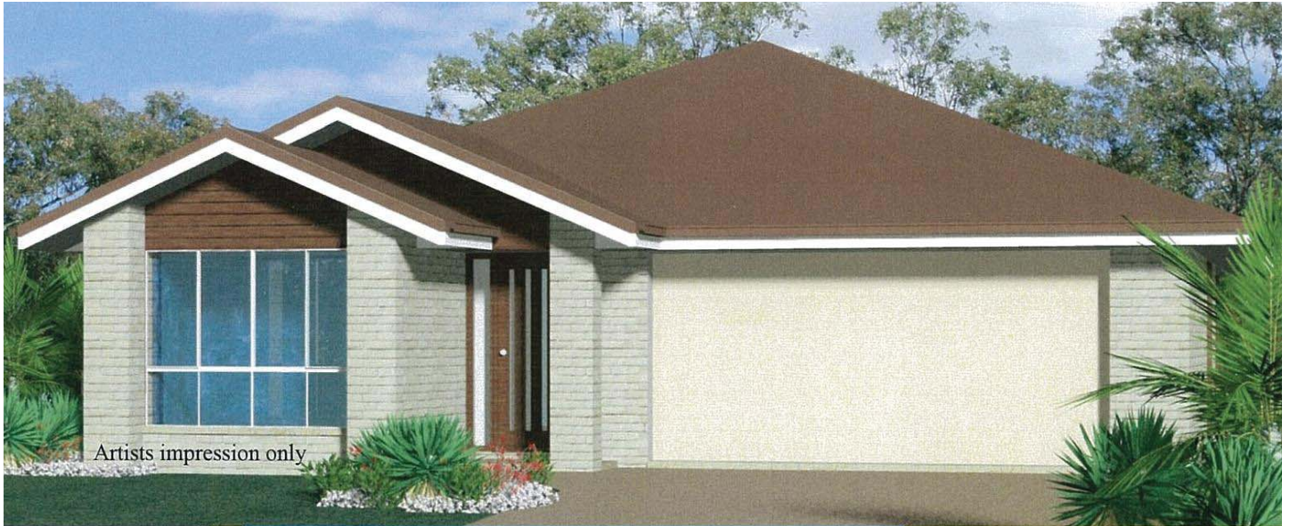
Artists impression only